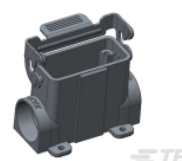
TE Part # T1619101120-000 H10A-SGRS-M20