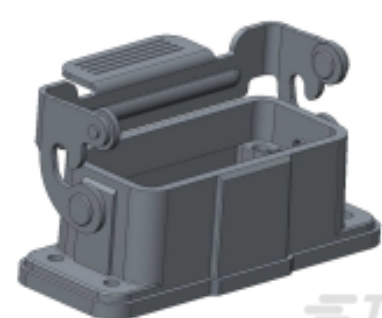
TE Part # T1509101000-000 H10A-AGS