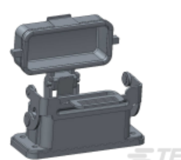
TE Part # T1519101000-000 H10A-ADMS