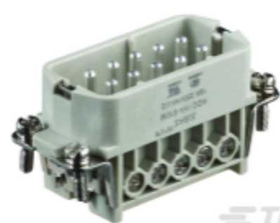
TE Part # T2010102101-000 HA-010-M